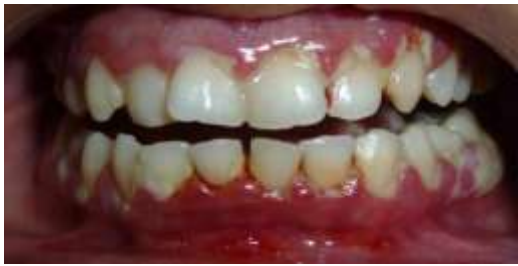
Fig 2: Erythematous inflammed gingiva with necrotic ulcerations and pseudomembrane. (day 1)