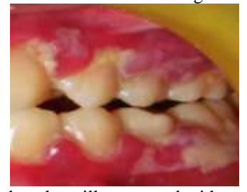
Fig 4: Generalized blunting of the interdental papillae covered with pseudomembrane in left buccal view. (day 1)