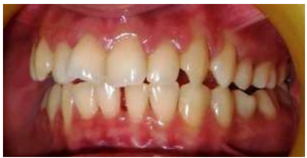
Fig 12: complete resolution of all the lesions on left buccal view. (day 10)