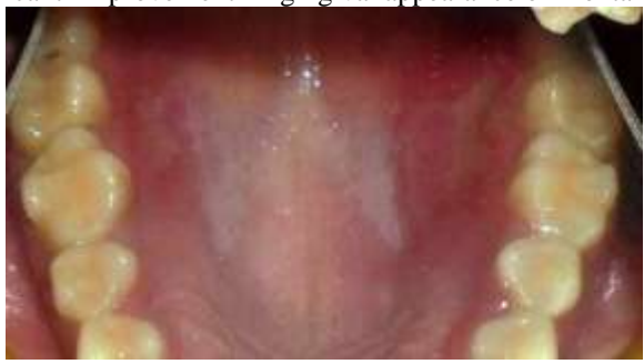
Fig 9: Significant improvement in gingival appearance on palatal view. (day 5)