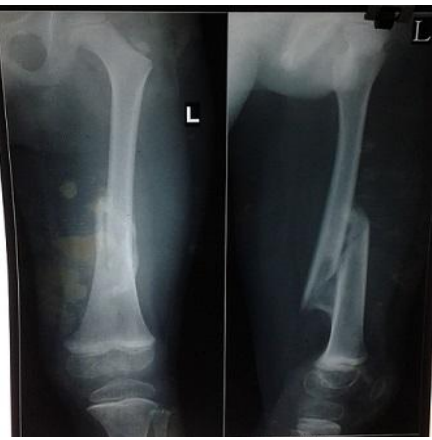
Fig1. Fracture shaft of Femur