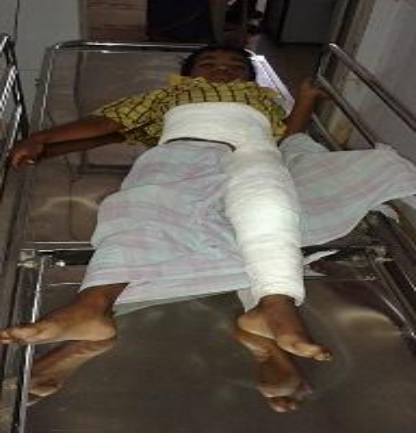
Fig 2. Spica application