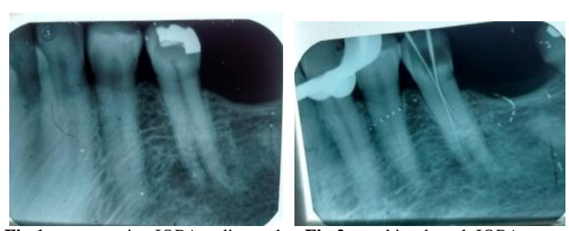
Fig 1: preoperative IOPA radiograph Fig 2: working length IOPA