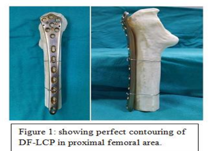
plate is anatomically precontoured for the metaphysis of the proximal femur. Either anterior or posterior locking threaded holes of the head of the plate can be left unengaged depending on the area covering the greater trochanter.