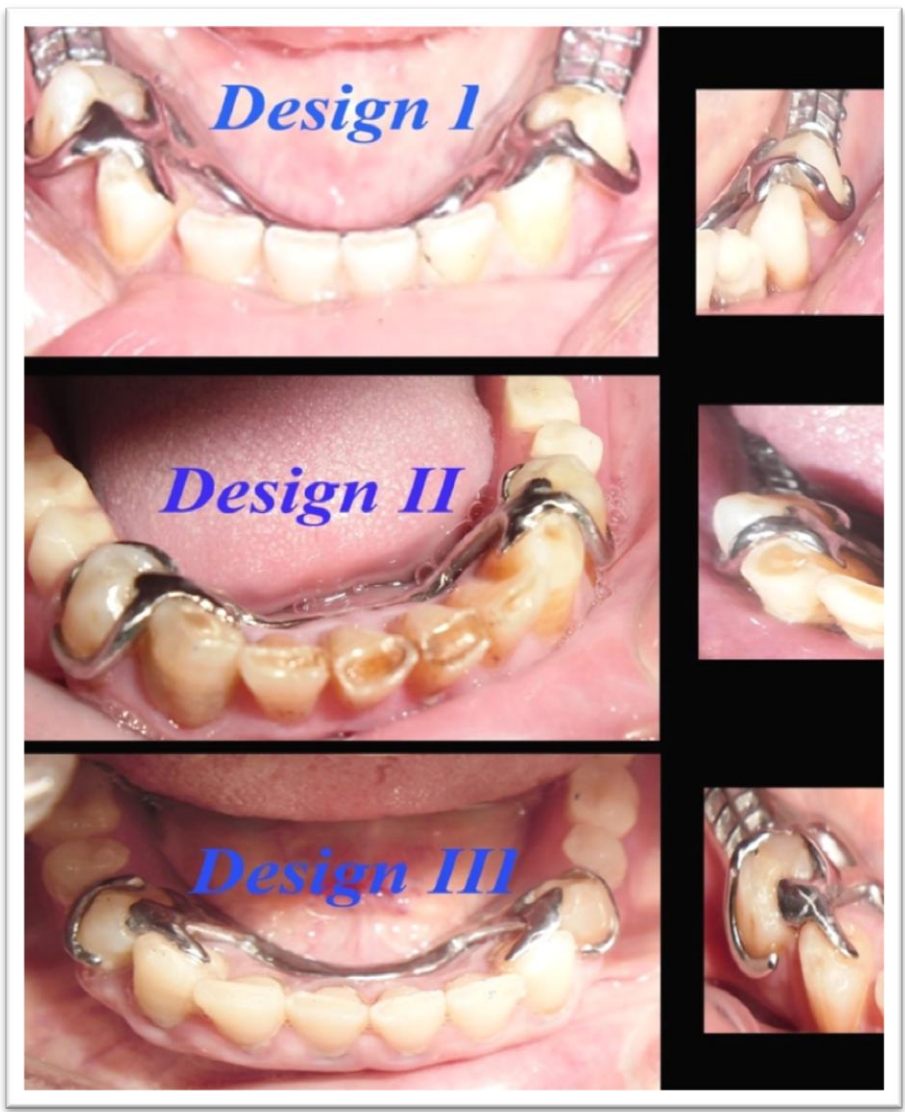
Fig 3: Different retainer units used to retain mandibular distal extension RPDs.