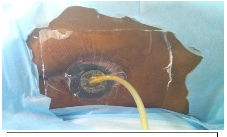
Fig.-1-Dressing of wound for VAC therapy

In patients of vacuum assisted therapy, sponge foam with the pore diameter of 400-600mm was placed on the wound. Then the wound and surrounding intact skin were covered by an adhesive drape.(Fig.-1) A suction tube was inserted in the dead wound space through the foam and the outer end of it was connected to the suction device that applies negative pressure at 125 mm intermittently for 5 minutes 5 minutes on and two minutes off.(Fig.-2) Wound dressings were changed usually every 48 hours and necrotic tissue and slough were also removed.