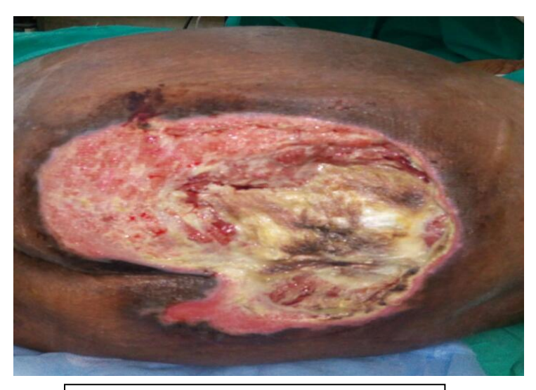
Fig.3-wound at the commencement of

In control group patients were treated with conventional dressings.wound was covered with saline soaked dressing twice a day and necrotic tissue and slough were removed. Standard antibiotic regimens and oral analgesics were administered to all of the patients. Ulcers were treated until the wound was closed spontaneously, or ready to undergo surgery or secondary healing. Time taken by the granulation tissue to appear was noted.The time till the wound is ready for surgery or secondary healing from the commencement of therapy was also recorded in all patients. All participants were followed up throughout the study.(Fig.-3 and Fig.4)