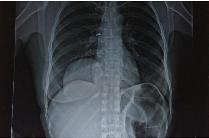
Chest Xray Pa View

CT chest was done and incidental and rare mediastinal mass was revealed i.e, Paraganglioma.