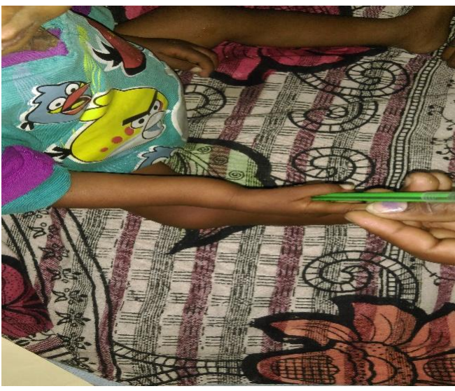
RIGHT WRIST SHOWING BONE DEFORMITIES