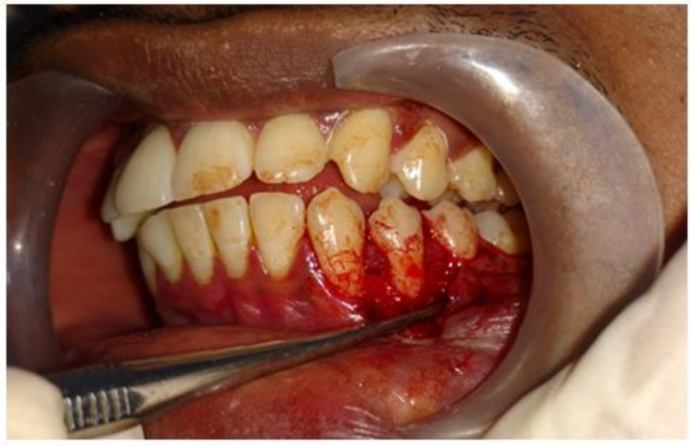
Fig.2 preparation of recipient site

On the elected day, after establishing profound local anesthesia, the marginal epithelium surrounding the tooth 34 was removed & full-thickness flap was raised up to the mucogingival junction to prepare a recipient bed. (Fig.2)