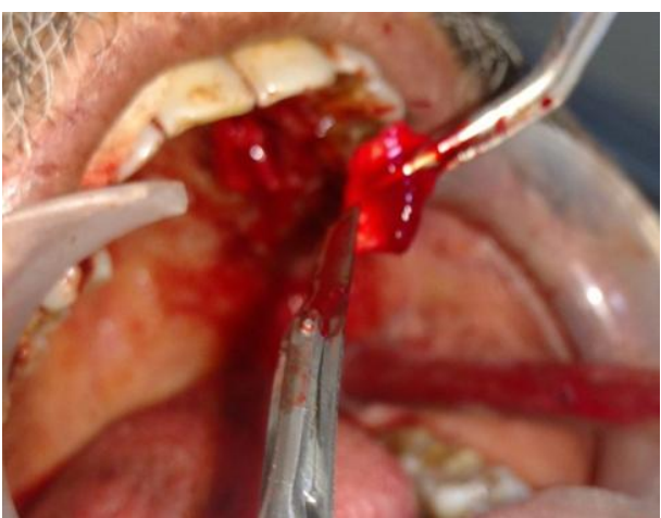
Fig.3 harvesting graft from donor site

The graft was then transferred & immobilized onto the recipient site through sutures 4-0 silk thread. The donor site was also sutured with 4-0 silk thread. (Fig.4 and 5)