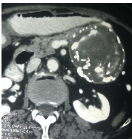
Fig 2:Post operative specimen of Distal pancreatectomy with splenectomy with the tumor