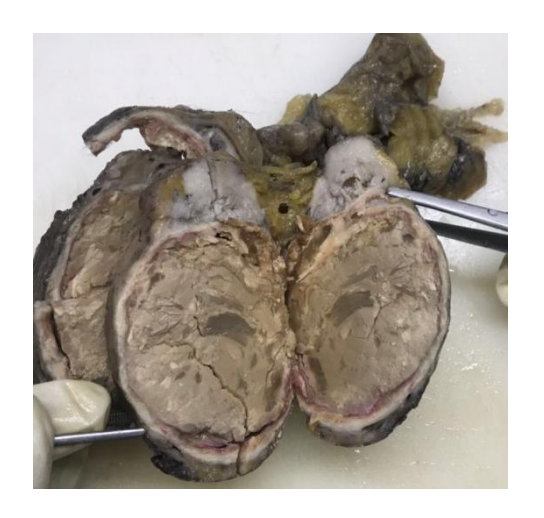
Fig 3:Cut section of the tumor