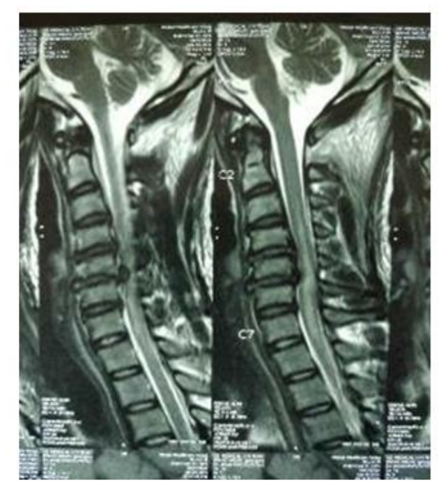
Figure 2: Magnetic resonance imaging cervical spine, mid-sagittal images with normal imaging on T1 and hyperintense on T2-weighted sequences, which was considered as edema group