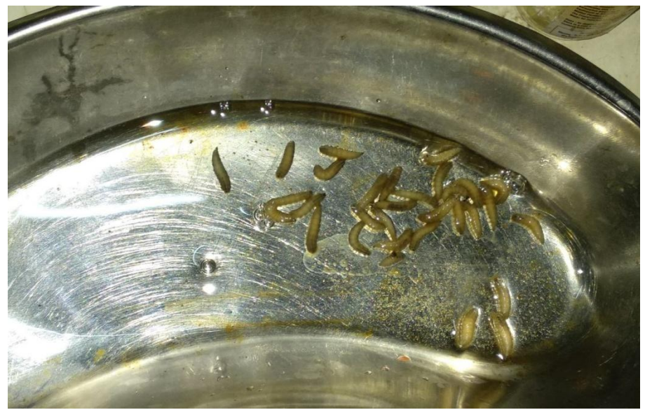
Fig: 2: Maggots kept in kidney tray for disposal