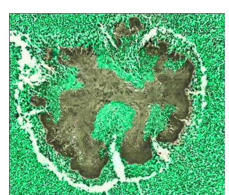
Fig.5. 100x showing GMS stain

Microscopic examination of sections studied shows gastric mucosa with ulceration, lamina propria shows dense inflammatory cell infiltrate composed of neutrophils,lymphocytes,plasma cells and histiocytes. One foci shows basophilic radiating actinomycotic filaments with splendore hoeppli phenomenon.lymphoid