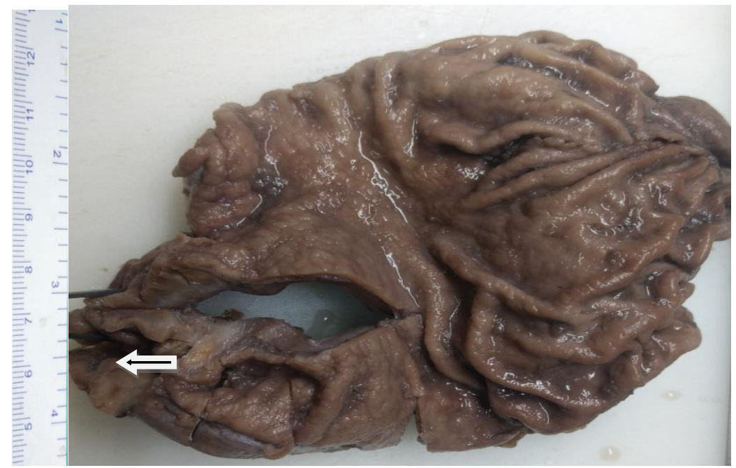
Fig.1. arrow head showing diffuse thickening of pyloric region

Grossly received subtotal gastrectomy specimen measuring 14 cm along greater curvature and 8 cm along lesser curvature. Cut surface shows diffuse thickening of the wall of pyloric region.