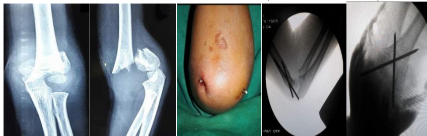
AP & LATERAL VIEW