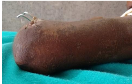
PIN TRACT INFECTION