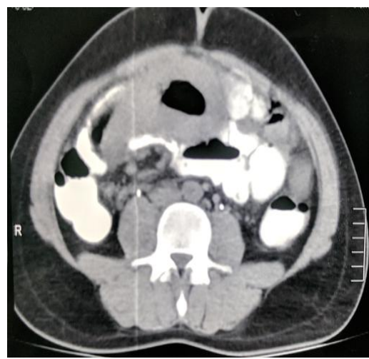
Fig 1.Cect Showing Aneurysmal Dilatation

A 15 year old boy was admitted with history of lower abdomen pain, vomiting, lower abdomen distension for 2 months along with history of malena, loss of weight and appetite. Physical examination revealed lower abdomen fullness and a vague mass in hypogastrium. His vitals were stable. His heamoglobin was 10.2, total count 6000, platelet-3 lakhs. Liver function test, colonoscopy, peripheral smear, bone marrow, chest and abdominal x-ray were normal. He was also negative for hiv and hepatitis b virus. Upper gastro intestinal endoscopy showed oedematous duodenal folds. Contrast ct abdomen showed thickening of ileal loop with maximal thickness of 2.8 cm. This thickened part of the ileum showed features of aneurysmal dilatation and mucosal irregularity with minimal distal flow of contrast noted. These ct findings were consistent with a diagnosis of small bowel lymphoma and the patient was taken up for laparotomy. Intraoperatively 25 cm long exophytic tumor with diffuse involvement of ileal wall 55 cm away from ileoceacal junction was present. Liver, spleen were normal. Resection of the involved segment of ileum, with a 10 cm of proximal and distal margin followed by primary anastomosis was done. Post op biopsy and immunohistochemistry showed high grade burkitt's lymphoma with cd-10, cd-20 strong positivity, Bcl 2 negative, Ki 67index 99%, and lymph nodal showed reactive hyperplasia. Patient is on follow up and is on R- CODOX-M chemotherapy.