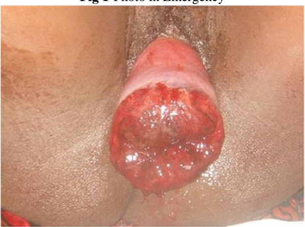
Fig 1-Photo in Emergency