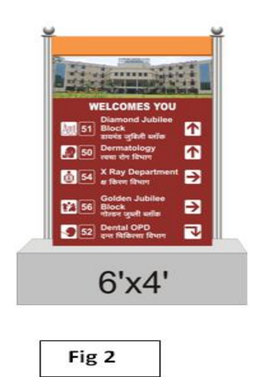
Fig 2: The figure depicts the sample signboard used in the way finding system with the above mentioned specifications