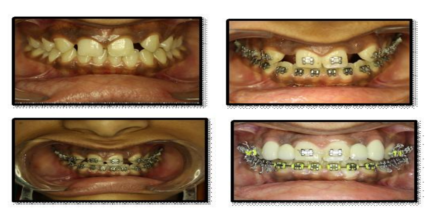
Figure 3: This patient had a peg-shaped maxillary right lateral incisor (A)Space were closed between two central incisors (B and C). By creating the appropriate space between canine and central incisor and positioning implants the lateral incisor correctly could be placed to enhance the occlusion and the aesthetic appearance of the teeth

Orthodontic therapy facilitate restorative reconstruction of the fractured tooth, abraded tooth along with treatment of gummy smile, congenitally missing lateral incisors & central incisor and implant placement.