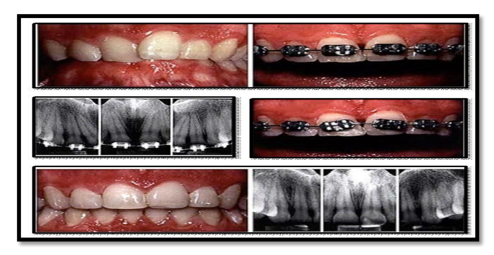
Figure1: This patient had irregularly placed maxillary central incisors initially (A), after intial orthodontic alignment of the teeth; space was present in the area of gingival embrasure was caused by divergence of the central incisor roots were moved together. This required restoration of the incisal edges and on mesial side after orthodontic therapy (E) because these teeth had worn unevenly before therapy. as the roots were paralled (F), the tooth contact moved gingivally and the papilla moved incisally, resulting in the elimination of the open gingival embrasure.<sup>5</sup>

When tooth is moved labiallyit may involve a chance of a bony dehiscence. Treatment of such modalities like recession area and root exposure can be predictably covered with various grafting techniques which most commonly involves gingival and pedicle grafting. The extent and achievement of the osseous surgery will depend on the type and variety of defect, i.e., crater,hemiseptal defect, furcation and/or three-walled defect, lesion. The wise and sensible therapist will know when and how to start directly orthodontic treatment and to identify defects will require pre-orthodontic periodontal surgical intervention. (Figure:1)