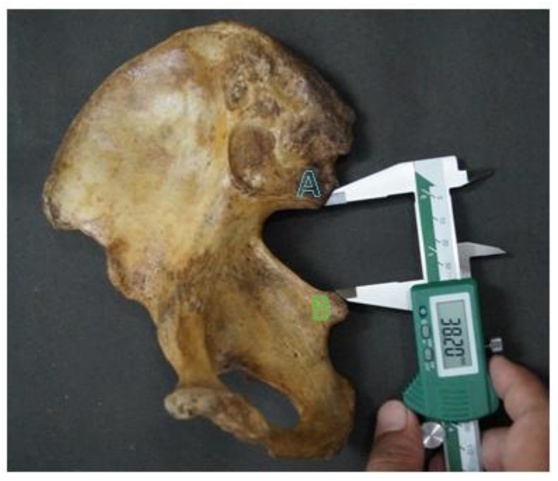
"Fig 1" Point A - Posterior Inferior Iliac Spine; Point B - Ischial Spine