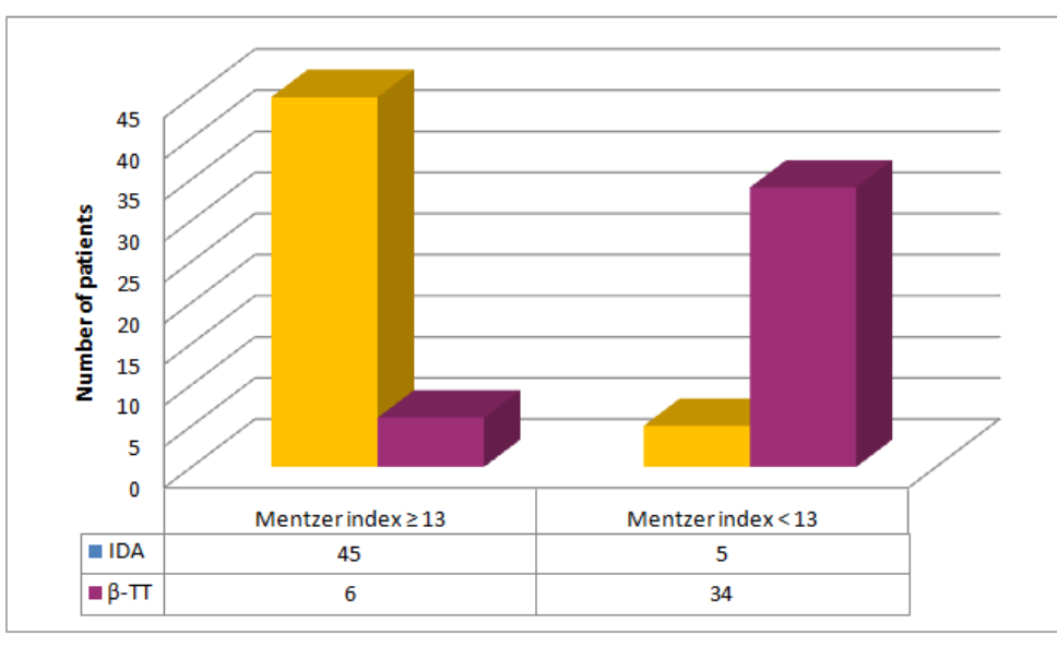
Figure (3) – Mentzer index for \beta -TT and IDA

The sensitivity, specificity, positive predictive value, negative predictive value & Youden's index were calculated for both Iron deficiency anemia and Beta thalassemia trait using the formulae as stated above in the description. The values have been tabulated below in table 1: