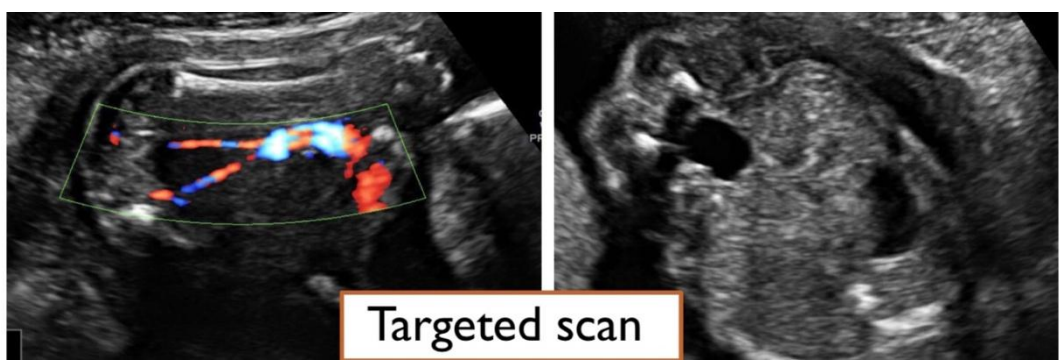
Figure1: normal target scan

Ultrasonography of abdomen done postnatally showed a mesentric cyst. Laparoscopic cystectomy with ovarian preservation was done for the baby. Laproscopic finding was an ovarian cyst [ Figure 4]. Histopathology report showed a simple cyst .