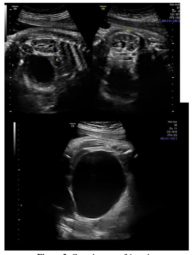
Figure 3: Growth scan at 36 weeks