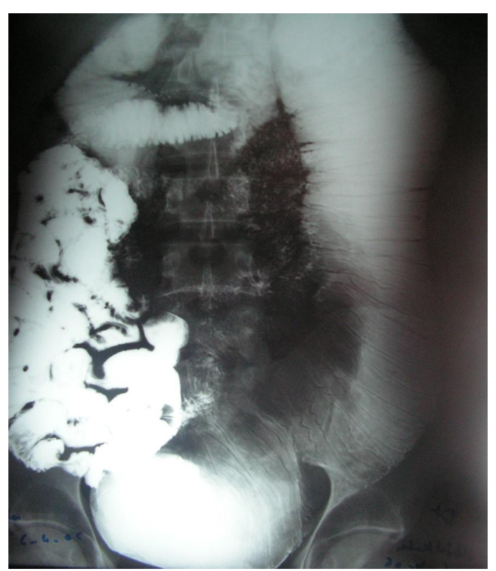
Figure 1: Opacification transit showing Mega-jejunum and stricture