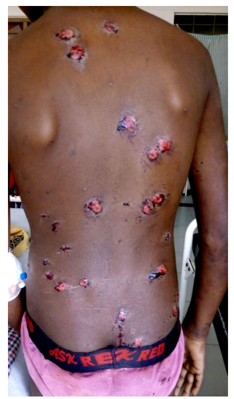
Figure 6: Hemorrhagic varicella in a 10year old