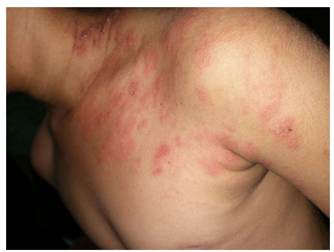
Figure 4: Herpes zoster in a 9 year old