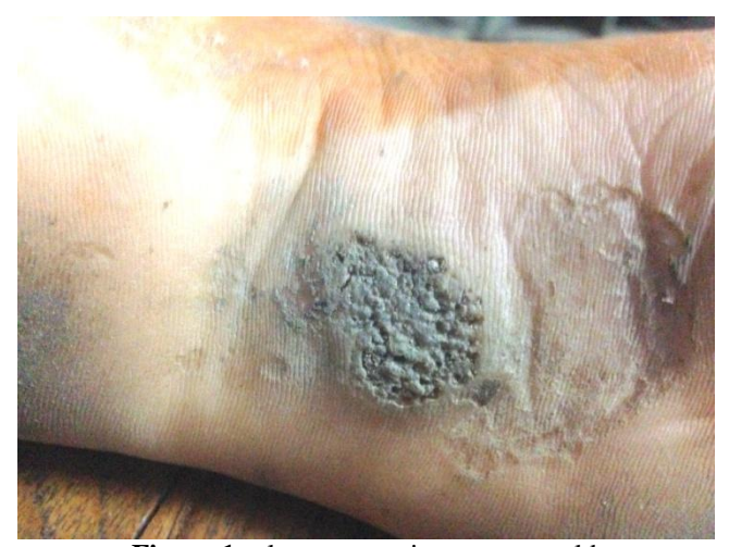
Figure 1: plantar warts in a ten year old

Herpes simplex (Figure 5)was reported in 46 cases. Face was the most common site affected .The youngest age group reported was 3 years and face is the most common site affected.