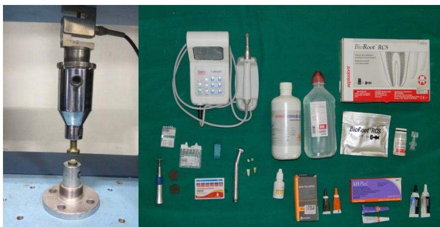
Sample under Universal Testing Machine.

The filling material was loaded with a 1- mm diameter cylindrical stainless steel plunger. Loading was performed on a universal testing machine at a speed of 0.5 mm/ min until deboning occurred. The load was applied in an apical- coronal direction to avoid any interference because of the root canal taper. The bond strength value in megapascals (MPa) was computed by dividing the maximum load needed to dislodge the filling material in Newton’s by the interfacial area (mm 2 ).