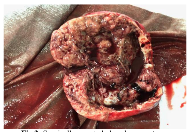
Fig.2: Surgically resected pheochromocytoma