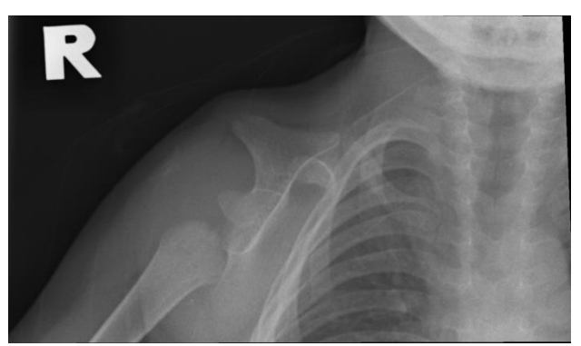
Fig-4: Chest radiography of patient at 2 years of age.