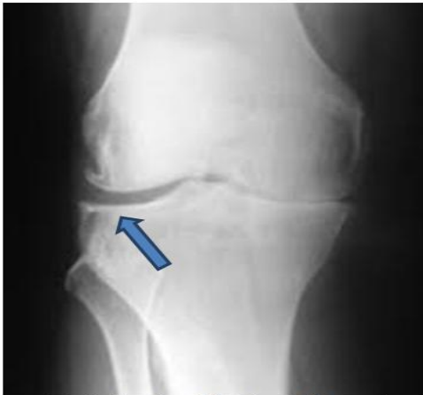
(Fig1 ) Osteoarthritis demonstrated by X-ray knee joint ,showing bone erosion and narrowing joint space particularly on right side (blue arrow)

The diagnosis of knee OA can be made in the presence of specific clinical and examination features even if a radiograph appears normal, and it is important to realize that additional further studies is needed to add another values for different imaging modality. (9,10)