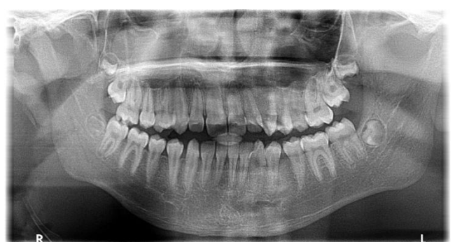
Figure no1 Radiographic aspects: class II of malocclusion, medial mandible line deviated 4 mm to the left Endo-oral examination revealed:

Exo and endooral examination was performed and the cephalic extremity was inclined to the left, facial asymmetry, mandibular and maxillary retrograde. It performed RX-OPT without showing signs of resorption of the teeth roots, class II of malocclusion, mandible median line deviated 4 mm to the left (figure no1, figure no 2). There are no studies to support the correlation between dental arch morphology, malocclusion and karyotype ^{2,3} .