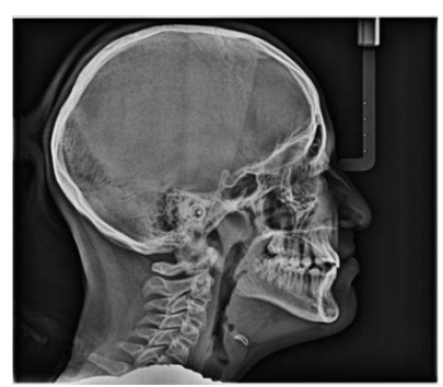
Figure no 5 Lateral cephalometry

Lateral cephalometry (figure no 5) was performed under standardized conditions, with teeth in centric occlusion.