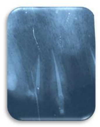
Figure 4. Radiopaque filling material in the coronal portion Figure 5. perforation was confirmed by negotiating approaching the lateral aspect of the tooth the site with a K file