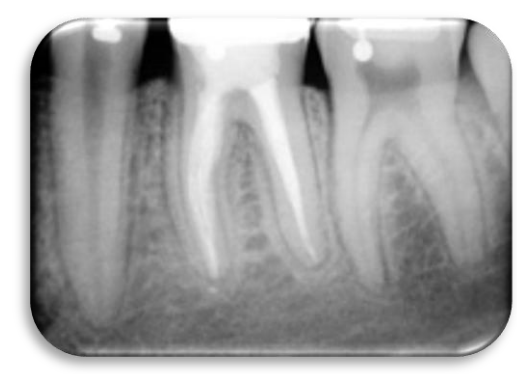
Figure3. 6months follow up