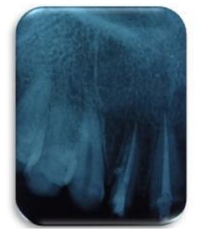
Figure 6. Perforation sealed with MTA