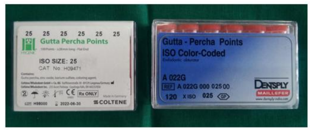
Fig 1.25 sizes of two different manufactures of gutta-percha cones Dentsply and Coltene

processed for microbiological culture. Theguttapercha cones were picked up using a sterile laboratory forcep and added to a tube containing 1.5 mL saline. Volumes of 500\mu L were pipetted outand processed for culture in two different culture media namely, Blood Agar and MacConky culture media. They were aerobically incubated in an incubator at 37° C for 24 hours. (fig .2). Colony growth reading was taken after 24 hours of culture.