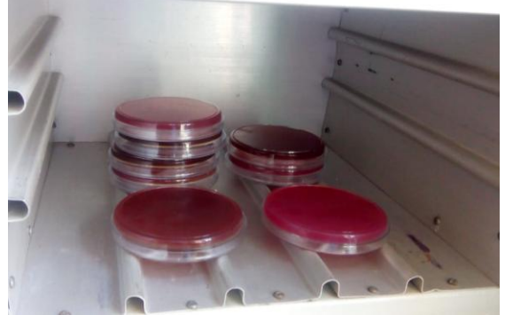
Fig: 2. Culture plate in an incubator

The same method was performed on day two and day three of opening the sealed packet, following all the aseptic measures and the microbial colonies were counted under the microscope in the lab.If any growth was noted on the culture plate, the bacterial colonies were counted and processed for microscopic examination for identification of microorganism by gram staining method.