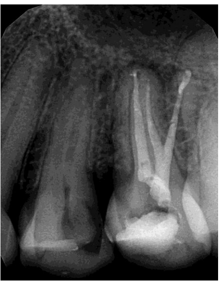
Figure 5: Three roots with three separate canals and foramina.