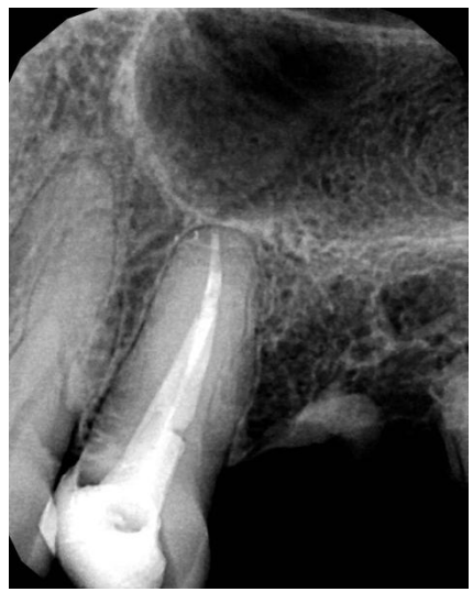
Figure 2: One root with two canals with one apical foramen.