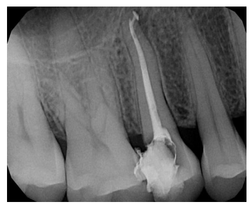
Figure 1: One root and one root canal.

A total of 200 patients 92 female (46%) and 108 male (54%) received root canal treatment of maxillary second premolar. The mean age of the patients was 32.7, ranging from 18 to 60 years. Out of the total of 200 maxillary second premolars 110 teeth had one root (55%), 86 teeth had two roots (43%), and one tooth had three roots (2%). Based on Vertucci's classification of root canal morphology, 57 teeth (28.5%) had type I canal configuration (one canal with one apical foramen, Figure 1), 53 teeth (26.5%) had type II (two canal orifices end in one apical foramen, Figure 2), and 86 teeth (43%) had type IV (two canal orifices end in two separate apical foramina, Figures 3 and 4). 4 teeth (2%) had type VIII (three canal orifices end with three separate apical foramina, Figure 5). The incidence of two canals (types II and IV) is 69.5%.