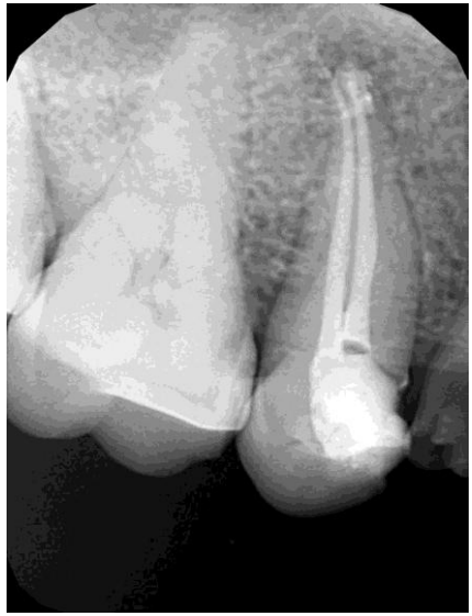
Figure 3: One root with two canals and two separate apical foramina.