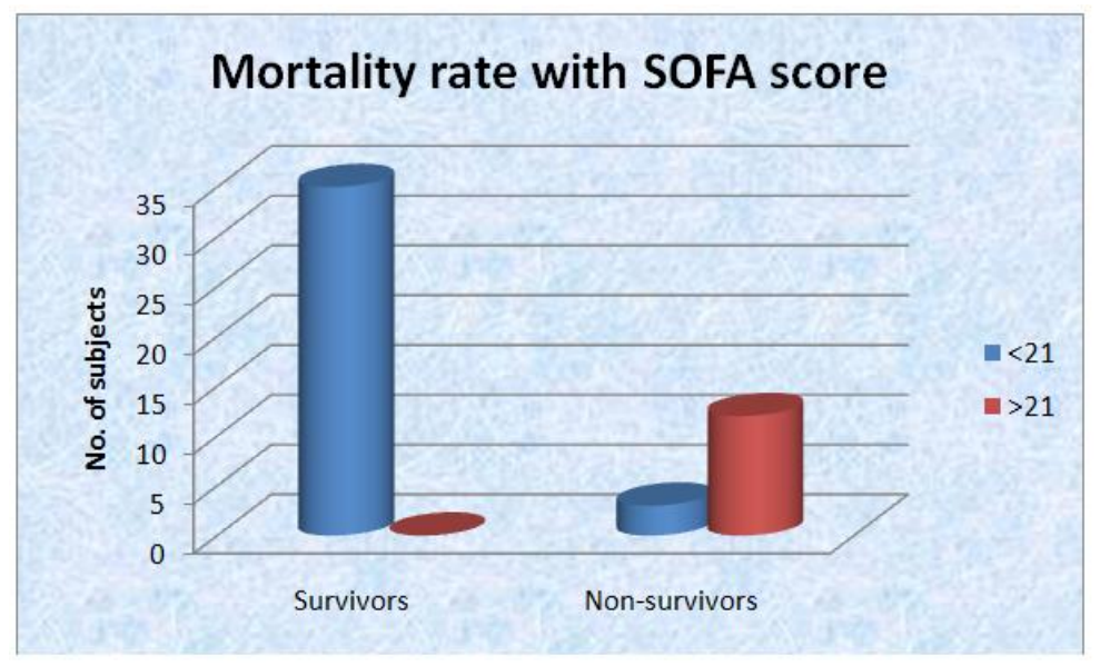
Graph 1: Mortality rate with SOFA score