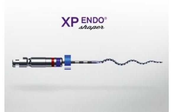
Figure 1. XP Endo Shaper

The XP-Endo Finisher R, which is a size 30 nontapered instrument made with the NiTi MaxWire alloy (Martensite-Austenite ElectropolishFleX, FKG Dentaire). Because of this special alloy, this instrument is straight in its martensitic phase, which is achieved below 30°C; however, when placed in the canal at the body temperature, it changes to the austenitic phase in which the instrument assumes a spoon shape in the last 10 mm with a depth of approximately 1.5 mm. When rotating, this instrument achieves a natural diameter of 3 mm in the last 10 mm (Fig. 2). According to the manufacturer, when the instrument tip is squeezed, the bulb can be expanded to 6 mm; when the bulb is compressed, the tip will expand to 6 mm. Thus, when the XP-Endo instrument is moved up and down for 7 to 8 mm inside the canal, the natural constrictions and expansions in the canal will alternately cause the bulb and tip to expand and contract. This makes the instrument scrape the canal walls and cause turbulence of the irrigant solution. It seems that the XP-Endo Finisher R instrument has the potential to be applied as an additional procedure in retreatment cases to maximize filling removal [19].