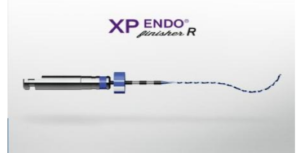
Figure 2. XP Endo Finisher R

The XP-Endo Finisher R, which is a size 30 nontapered instrument made with the NiTi MaxWire alloy (Martensite-Austenite ElectropolishFleX, FKG Dentaire). Because of this special alloy, this instrument is straight in its martensitic phase, which is achieved below 30°C; however, when placed in the canal at the body temperature, it changes to the austenitic phase in which the instrument assumes a spoon shape in the last 10 mm with a depth of approximately 1.5 mm. When rotating, this instrument achieves a natural diameter of 3 mm in the last 10 mm (Fig. 2). According to the manufacturer, when the instrument tip is squeezed, the bulb can be expanded to 6 mm; when the bulb is compressed, the tip will expand to 6 mm. Thus, when the XP-Endo instrument is moved up and down for 7 to 8 mm inside the canal, the natural constrictions and expansions in the canal will alternately cause the bulb and tip to expand and contract. This makes the instrument scrape the canal walls and cause turbulence of the irrigant solution. It seems that the XP-Endo Finisher R instrument has the potential to be applied as an additional procedure in retreatment cases to maximize filling removal [19].