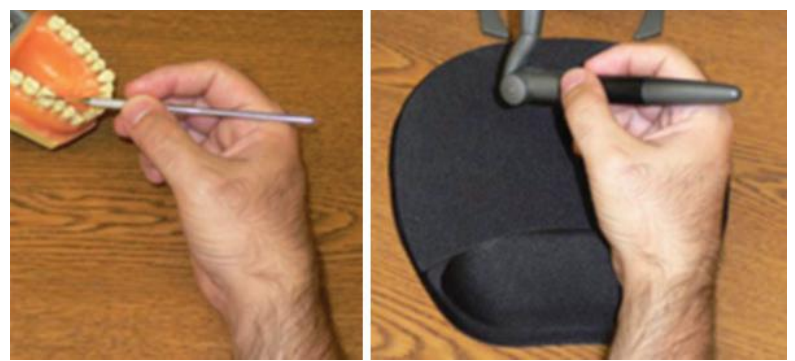
Fig. 5: Comparison between handling the real instrument and the haptic stylus

Recording of the haptic experiences involves the production of instructor- driven trajectories to define correct movements of the dental instrument when performing the periodontal procedure. These recordings can be stored in the system for future use by students and will guide their performance of a procedure. The methods used by an individual instructor to both diagnose and treat a particular procedure can be demonstrated while guiding students to perform the procedure in the same fashion.