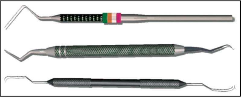
Fig. 4: Virtual periodontal probe, explorer, or scaler

Using the control panel, one of three periodontal instruments can be selected for onscreen use: aperiodontal probe, explorer, or scaler [fig. 4].