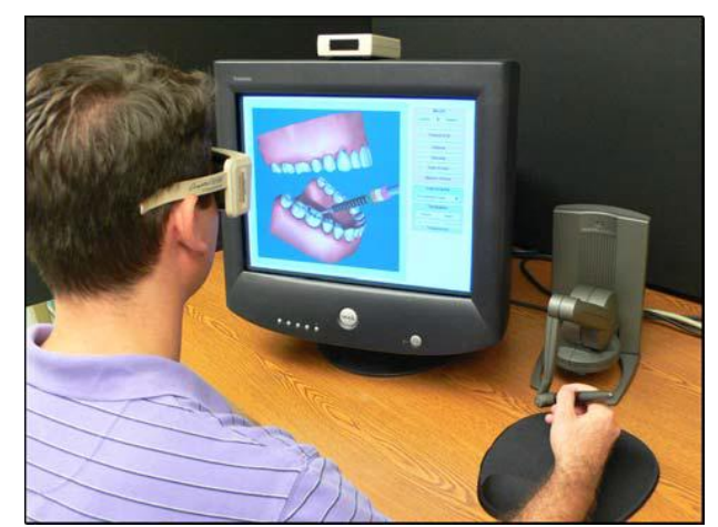
Fig 1: Simulator setup and comparison between handling the real instrument and the haptic stylus

Theyconsist of a haptic device[fig 1] and virtual models of a human tooth or mouth which acts as a platform to facilitate dental practicing. It works on the principles of creating virtual environment, which replaces the reality, and user can interact to perform various motor and perceptual tasks.