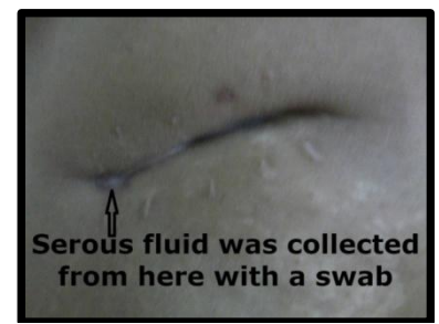
Figure1: Serous fluid was collected from here with a swab

Samples were collected for a period of twelve months. . Total number of cases were 512.