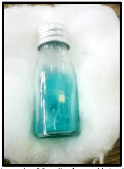
Figure 2: Colony observed on LJ media after aerobic incubation within 6 days

There was no growth observed on the former two culture media after a week of aerobic incubation, but the Lowenstein Jensen media showed presence of non-pigmented colonies at the end of 6 days of aerobic incubation.