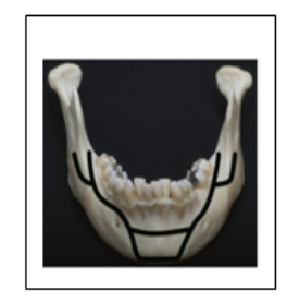
Zone of tension and compression<sup>1</sup>