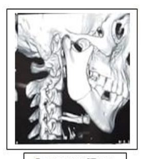
Pre operative CT scan