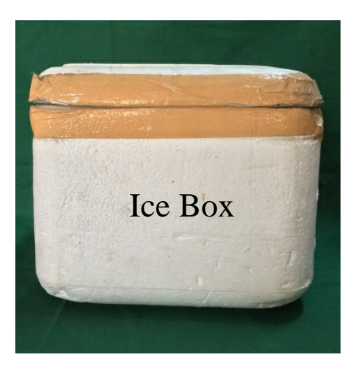
Fig. No.5: Plaque Collection and Transportation