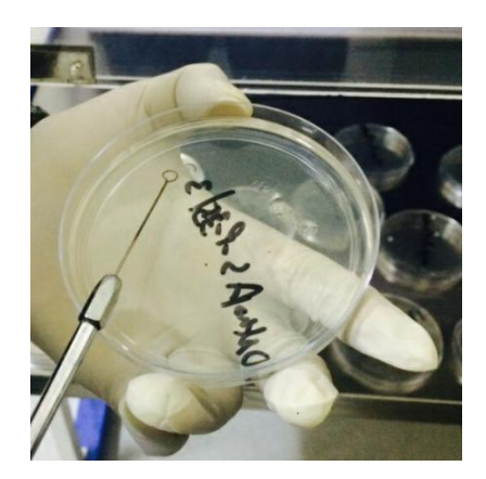
Fig No. 9: Spreading of Plaque Sample over Petridish