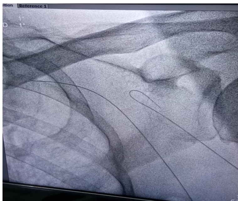
Figure : showing terumo wire in axillary vein near to rib margin and cephalic vein near to corocoid process