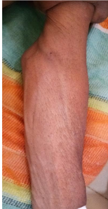
Figure: showing basilic vein