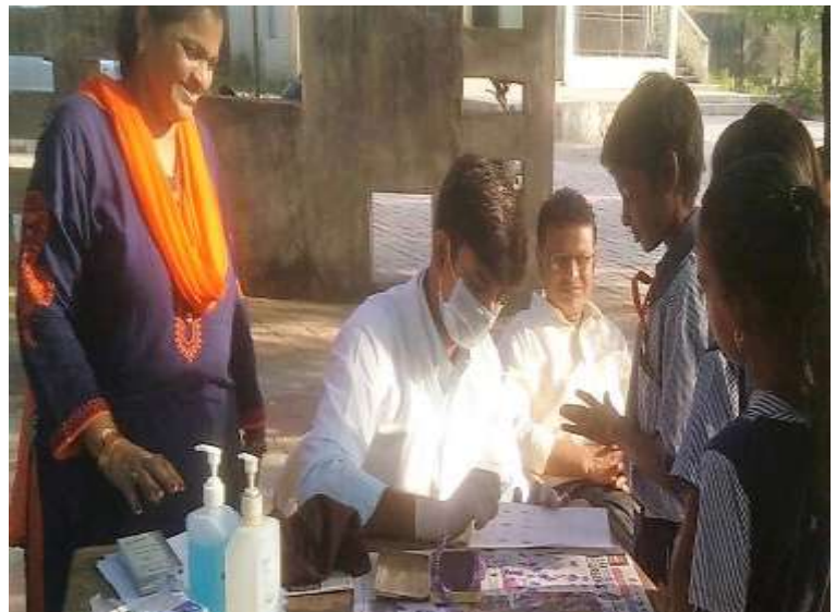
Figure 3: Recording of fingerprints using ink-stamp pad method

At the onset, hands were cleaned with soap water, followed by scrubbing with an alcoholic rub hand disinfectant and allowed to dry. Following this, right hand fingers and left hand fingers were directed by researcher to ink stamp pad and pressed firmly on white paper which was placed on flat surface. (Fig. 3)