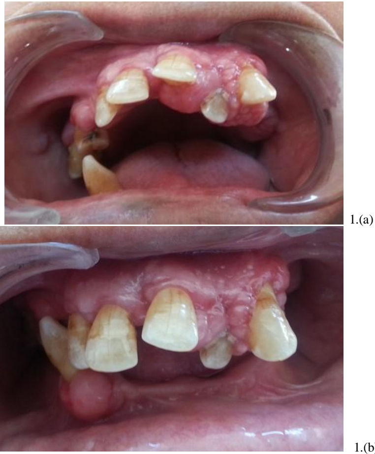
Figure 1: Clinical image Pre-operative