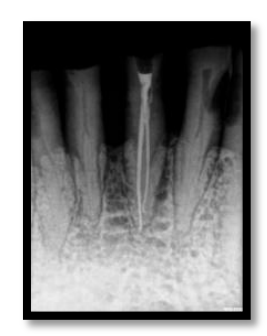
Fig.5 Radiograph showing Obturation done