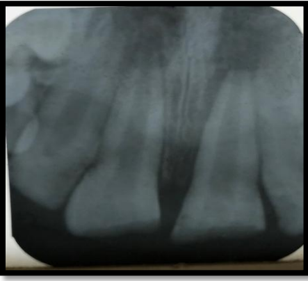
(Fig.2) Pre-operative IOPAR