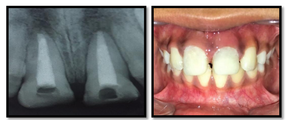
(Fig.5) Post Obturation