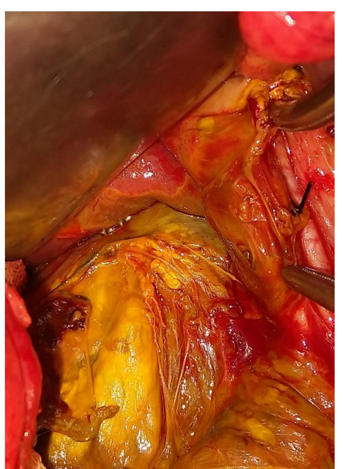
Figure 4. Perforation over posterior wall of CBD with small glistening stone coming out.