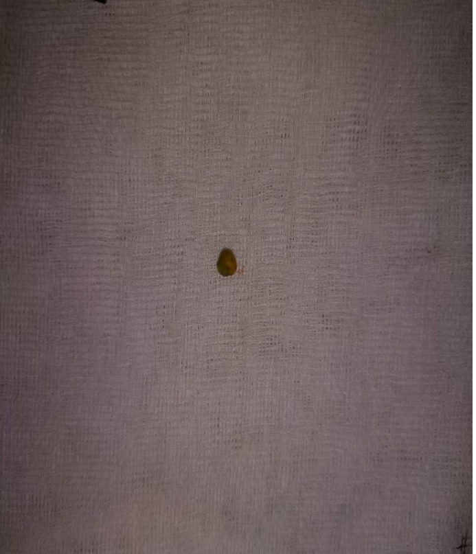
Figure 5. Small stone which came out of perforation.