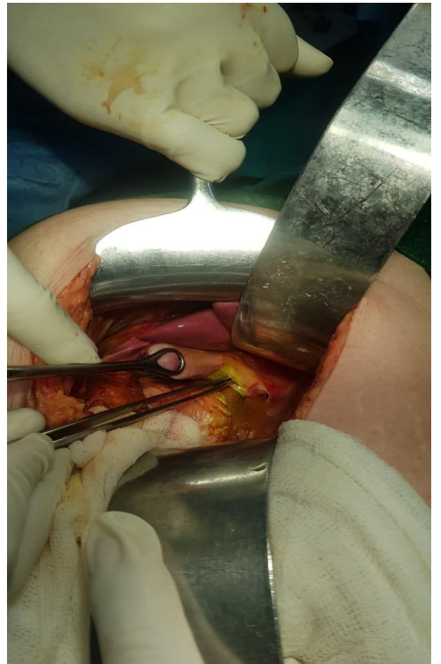
Figure 1. Perforation in distal body of gallblader with impacted large stone at Hartmann's pouch.

6 patients had different comorbidities which included hypertension, diabetes mellitus, ischemic heart disease, chronic kidney disease and chronic obstructive pulmonary disease. 3 patients presented with diffuse peritonitis. CECT abdomen was done in 5 patients. 6 patients were managed conservatively in view of improvement after initiating injectable antibiotics and CT documented sealed gallbladder perforation. 9 patients were treated surgically. 13 patients had gallbladder perforation (Figure 1) and 2 patients had CBD perforation.