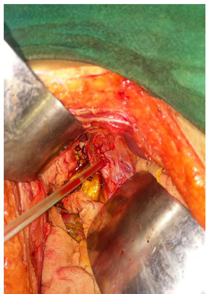
Figure 7. T tube inserted after making anterior choledochotomy.

After thorough peritoneal lavage, cholecystectomy with primary repair of posterior CBD perforation with anterior T- tube drainage was done (Figure 7). One tube drain kept in subhepatic space and another in pelvic cavity.