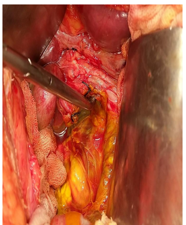
Figure 6. Tip of lahey's right angled clamp introduced inside CBD through perforation posteriorly.