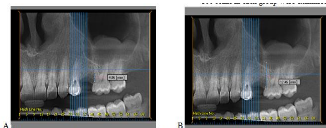
Fig 1: CBCT image, panoramic view, A) measurement of the distance from CEJ to the highest point of the alveolar bone. B) measurement of the distance from CEJ to the apex of the longest root

Based on availability of the samples,the scans categorized in to 2 groups of( Mild) and (Moderate/ Severe) and 100 scans in each group were examined.