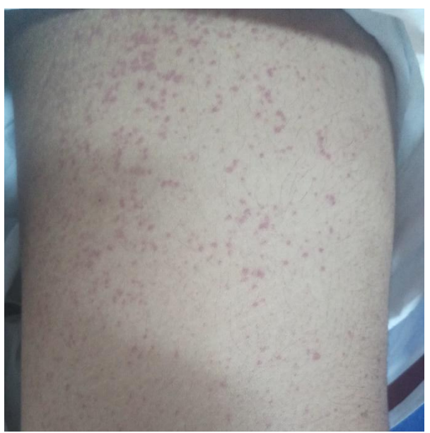
Fig 3a: Crops of purpuric spots over thigh

Renal parameters showed nephritic range proteinuria, hematuria. Patient started on IV steroids (Methylpredinsolone 1mg/kg body wt) onPost Operative Day 4. Skin biopsy of the purpuric spots was taken, which confirmed leukocytoclasticvasculitis.