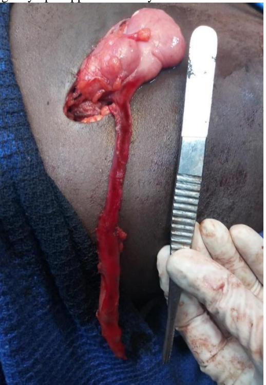
Fig 2: On table appendix specimen after ligating mesoappendix

Patient was taken up for an emergency openappendicectomy.