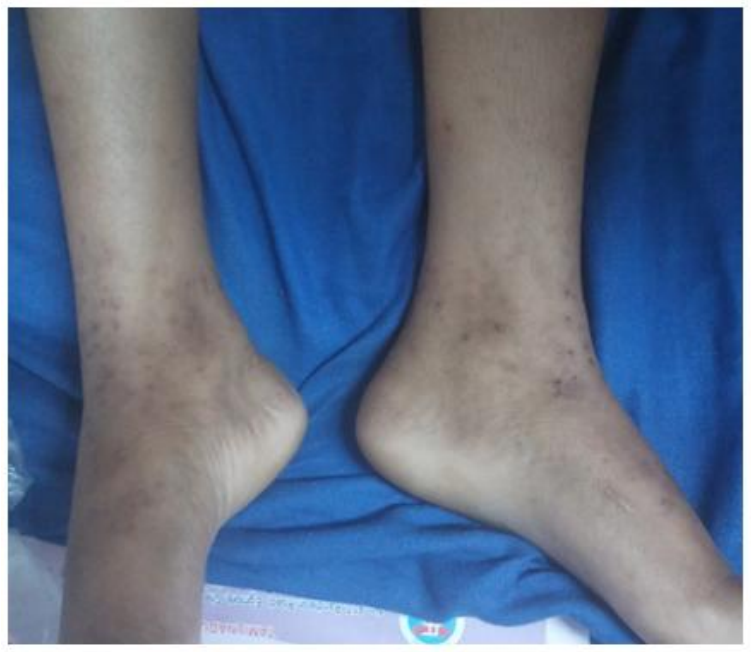
Fig 3c: Crops of purpuric spots over legs and feet