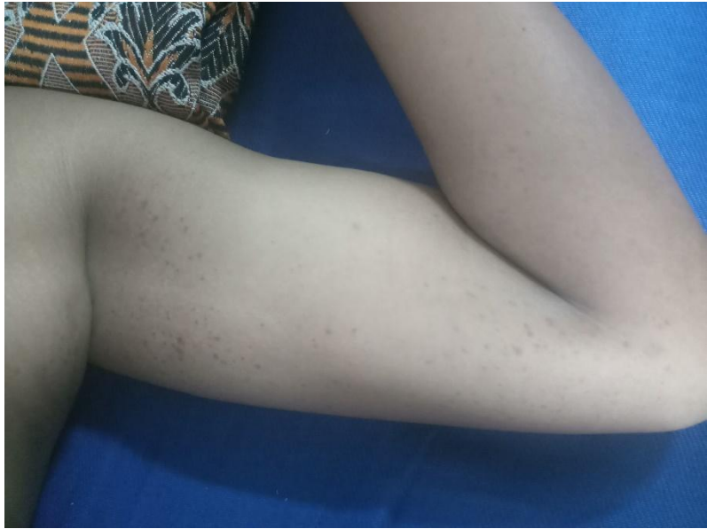
Fig 3b: Crops of purpuric spots over arm