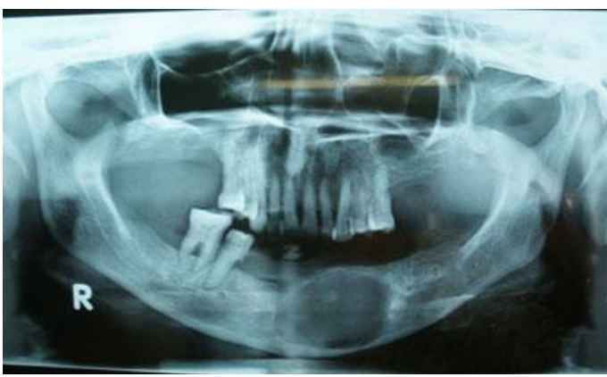
Fig 2: Panoramic radiograph demonstrating well-defined unilocular radioluscency in the left mandible