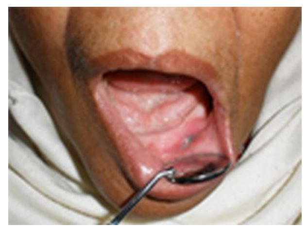
Fig 1: Intra-oral view

To conclude, the purpose of presenting this report of UA is to emphasize the importance of histopathologic investigations of tissue specimens, even when clinical and radiological findings are innocuous.