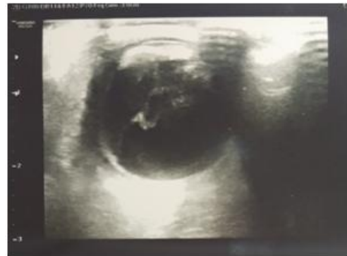
Picture 3 and 4: Self sealed corneal tear with pseudophakic retinal detachment in B scan.