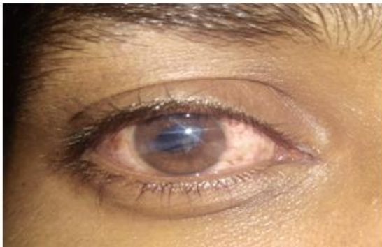
Picture 1 and 2: Repaired corneal tear with anterior vitreous degeneration in B-scan.

In our study, 58 patients operated for tear, 21 eyes with traumatic cataract treated surgically with intraocular lens (IOL) implantation. Seven patients operated vitrectomy for vitreous hemorrhage, retinal detachment, endophthalmitis and or IOFB and three were needed evisceration.