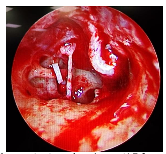
Fig1: Intraoperative picture of stapedotomy with Teflon prosthesis

The surgery was done under local anaesthesia, via a transcanal approach. All cases were performed with microscopic approach. The stapes footplate was tested for fixation to confirm the diagnosis of otosclerosis. The prosthesis we used was a Teflon piston design where both the diameter and length could be selected. The distance between the underside of the incus and surface of the footplate was measured, to assist in the selection of a prosthesis which was 0.25 mm longer than this measured distance.