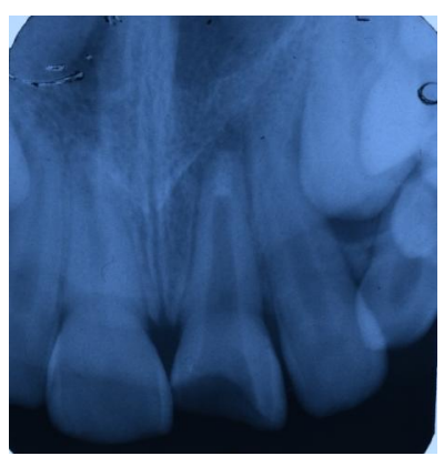
fig 4.MTA plug