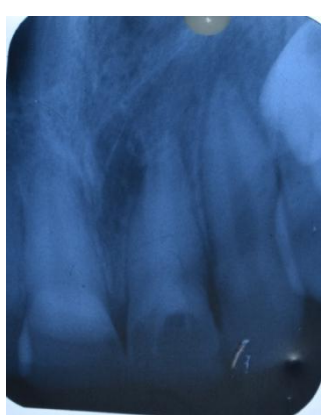
Fig 4. 9 months follow up