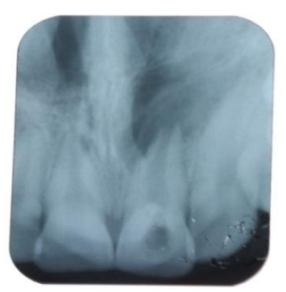
fig 1. Preop IOPA

A 10 year old male patient reported with the chief complaint of pain in the upper front tooth since one week. There was a history of trauma to the same tooth about 1 year back. On clinical examination Ellis class 4 fracture in permanent maxillary left central incisor was evident. Intraoral periapical radiograph of the same tooth showed incomplete root formation and wide open apices(fig 1). Apexification with calcium hydroxide dressing was planned. In the first visit, access cavity was prepared with a straight line entry into the root canal. The working length was established within 1 mm of the radiographic apex by using size 30 Hedstrom file. Then complete debridement of the root canal was done using Hfile number 40 followed by copious irrigation with normal saline. Next the canal was dried using paper points and calcium hydroxide powder was mixed with normal saline and with the help of plugger this mixture was placed into the canal pushed to the short of apex. Access opening was restored with GIC. Patient was recalled after 3 months, 6months and 9 months and periapical radiographs were taken (fig 2 ,3) . After 9 months periapical radiograph confirmed complete formation of root apex in maxillary left central incisor, without any signs and symptoms and periapical radiolucency(fig 4). Then complete obturation was carried out with GP using lateral condensation technique(fig 5).