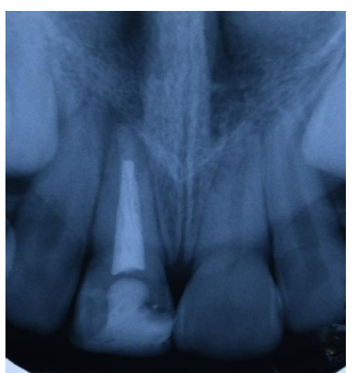
fig 6.composite build up done