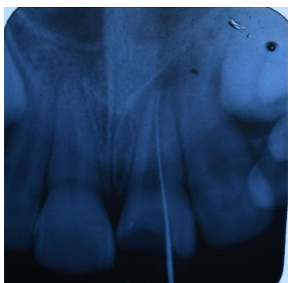
Fig 3. Working length IOPA