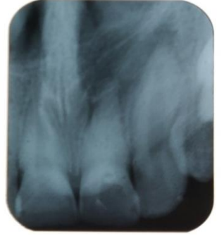
fig 2. CaOH dressing 3monthsfollow up