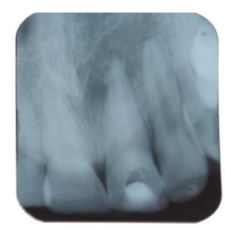
fig 3. 6 months follow up