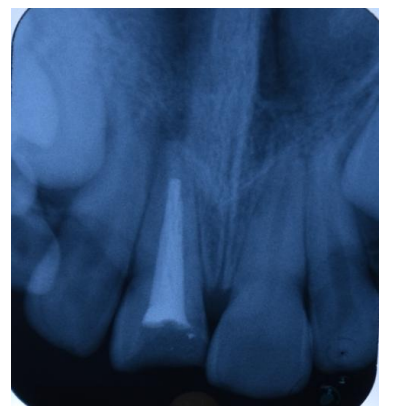
Fig 5. MTA plug and obturation done