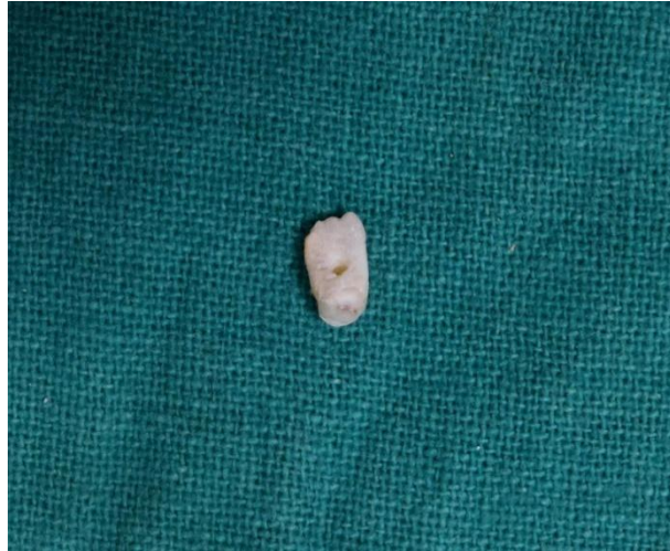
Figure 3: Access cavity prepared on the crown.