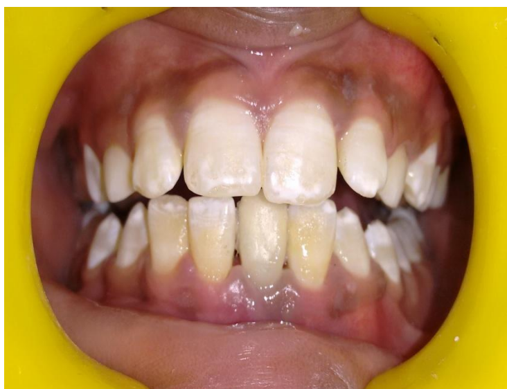
Figure 7: Post operative view after 1 year follow up.

Saumil Mogre, et. al. "Management of Crown Dilaceration Using Natural Tooth Pontic: A Case Report." IOSR Journal of Dental and Medical Sciences (IOSR-JDMS) , 19(6), 2020, pp. 28-32.