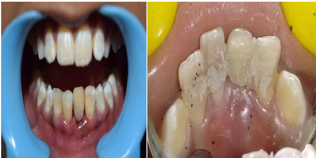
Figure 6 (a) and (b): Immediate post operative view.