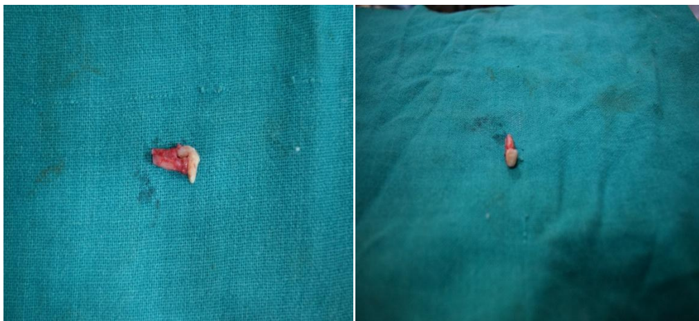
Figure 2 (a) and (b): Dilacerated tooth after extraction.