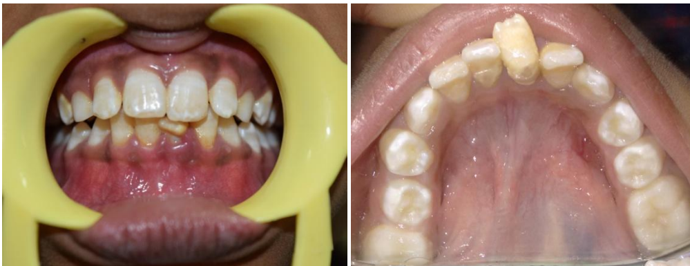
Figure 1 (a) and (b): Pre-operative view showing dilacerated crown of left mandibular central incisor.